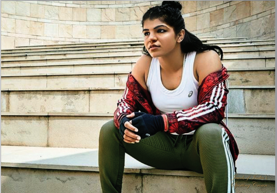
Jewels of India's Sporting Crown