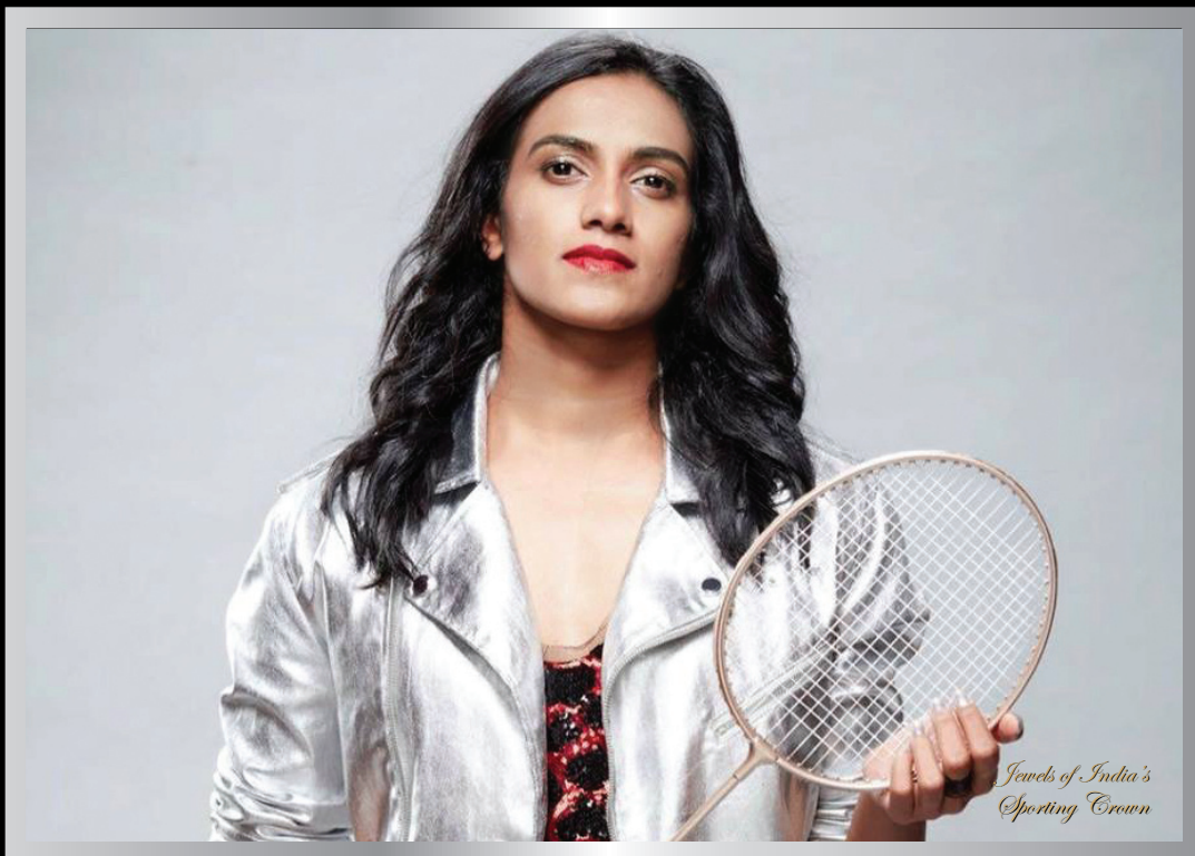
Jewels of India's Sporting Crown