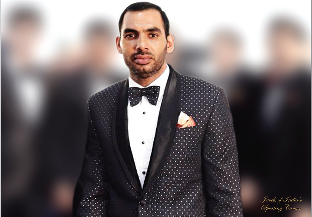
Jewels of India's Sporting Crown