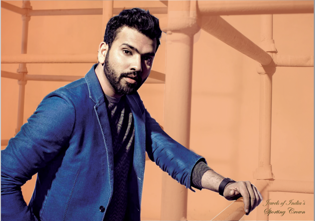
Jewels of India's Sporting Crown