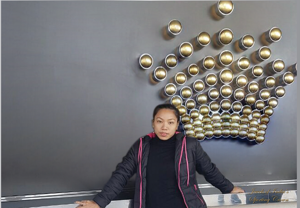
Land of India's Sporting Crown