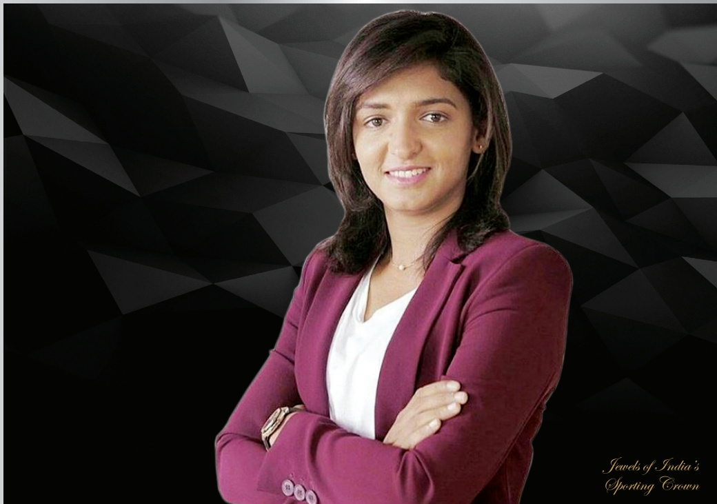
Jewels of India's Sporting Crown