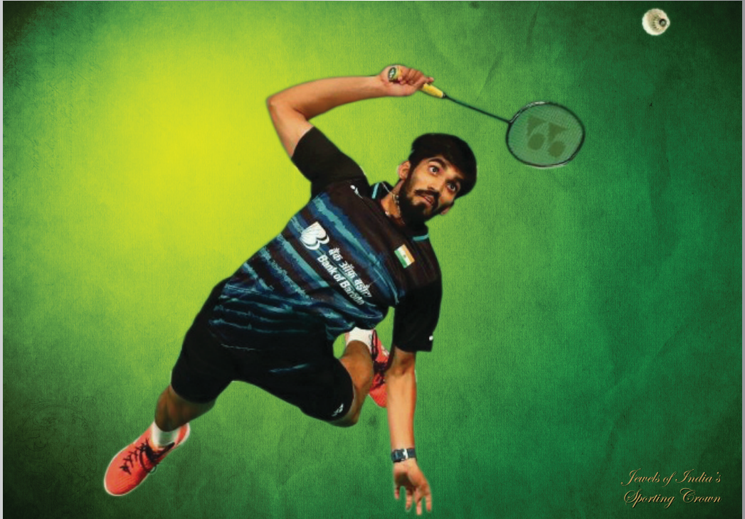
Jewels of India's Sporting Crown