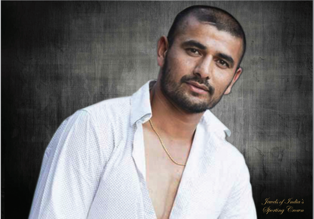
Jewels of India's Sporting Crown