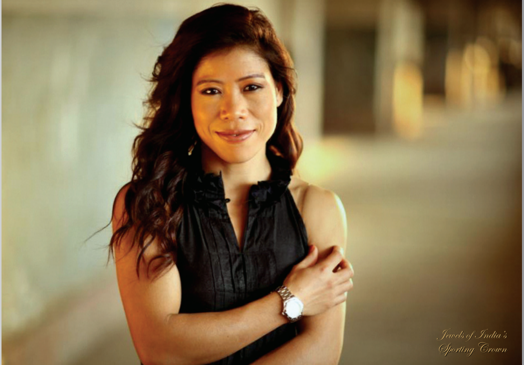
Jewels of India's Sporting Crown