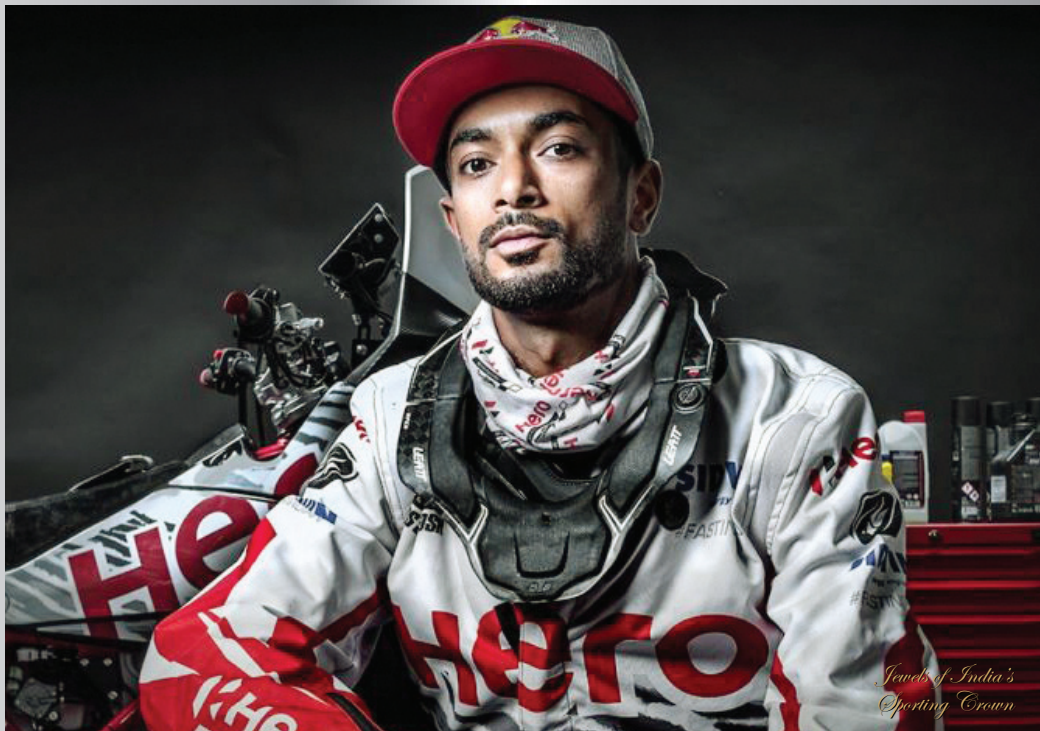
Jewels of India's Sporting Crown