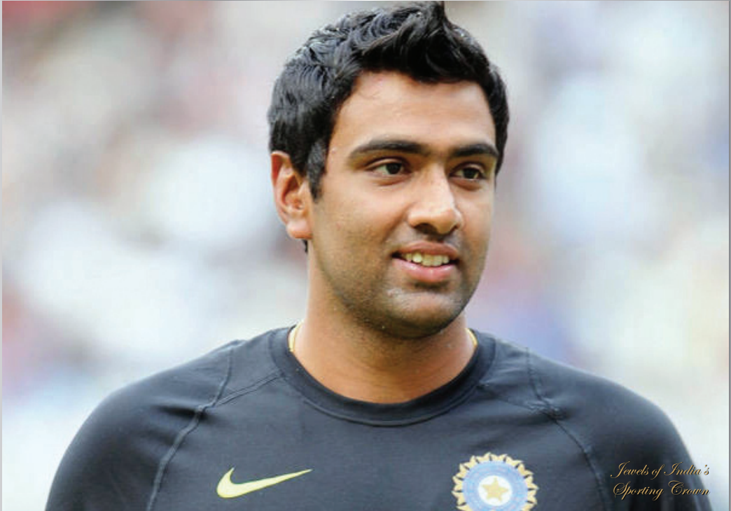
Jewels of India's Sporting Crown